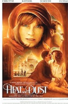
Heat And Dust