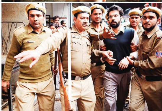
Closing night movie, Omerta