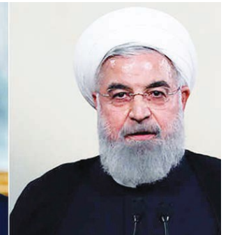
contd on page 32