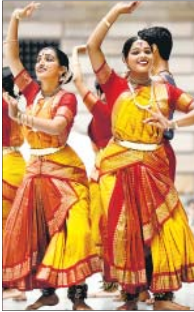
■ Kalinga Nartana by Sampradya Dance Creations in the Erasing Borders festival in New York